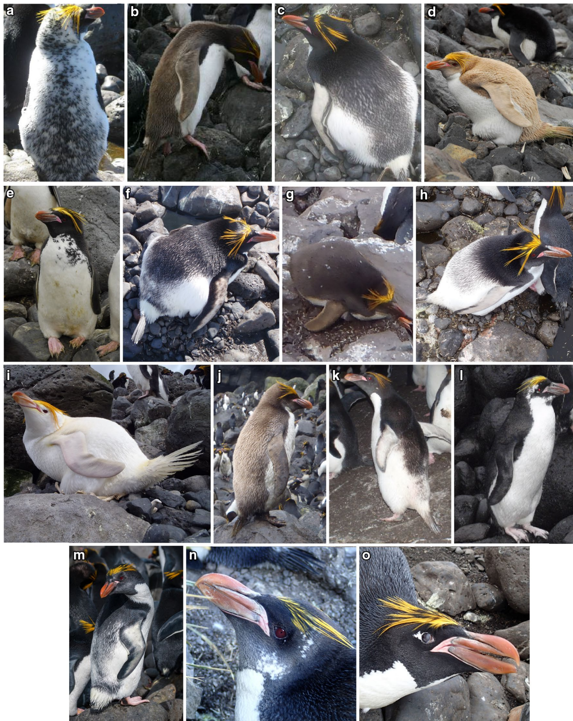
Fig. 2 Macaroni Penguins Eudyptes chrysolophus observed between 2008 and 2016 at sub-Antarctic Marion Island with plumage aberrations. See Table 1 for date, location, breeding status and description

of plumage aberration. The plumage aberrations of each penguin was described as follows, partial leucism (a, c, f, h, k–o), isabellinism (b, d, g, j), partial melanism (e) and full leucism (i)